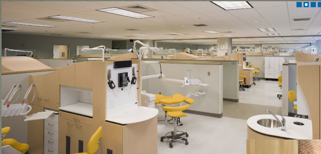
University of Maryland Dental School – Baltimore, MD