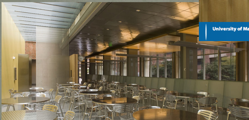
University of Maryland Dental School – Baltimore, MD