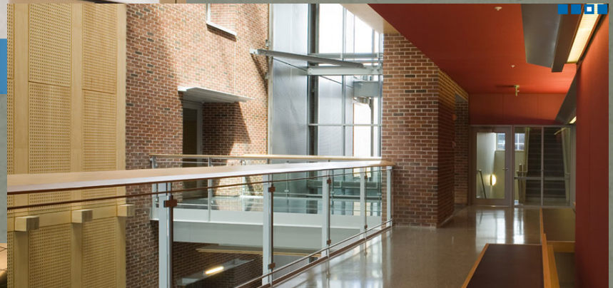
University of Maryland Dental School – Baltimore, MD